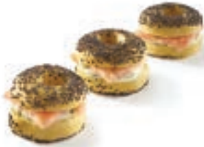
Mini Smoked Salmon Bagel 160 482_

Christmas time is party time! We added some new lines to ensure you have everything you need for party nights and large christmas gatherings.