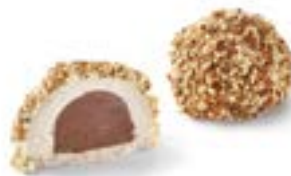
Boule Rocher 909 53

Chocolate ice cream, praline ice cream with whipped cream coating and praline.