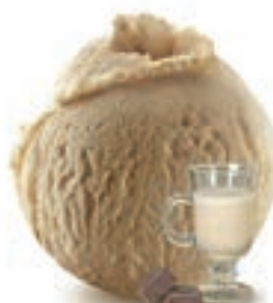
Bailey's Ice Cream 926 99