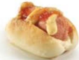
Mini Hot-Dog New-Yorker 967 21

Poultry sausage in a soft bread with ketchup and mustard. To be cooked without defrosting.