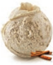
Cinammon Ice Cream 923 01