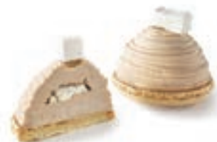
Royal Mont Blanc 954 90

Elevated french classic. Giant macaron shell with chestnut mousse, hidden meringue and vanilla marshmallow topping.