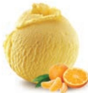
Mandarin of Sicily Ice Cream 925 17