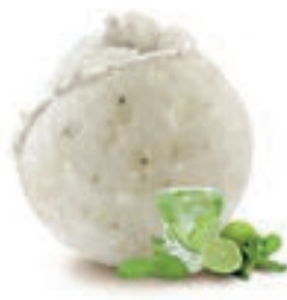
Mojito Sorbet 927 09