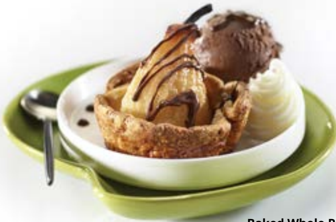
Baked Whole Pear Tart 4578

Rustic caramelised puff pastry case with apple compote & whole Williams pear roasted with brown sugar.