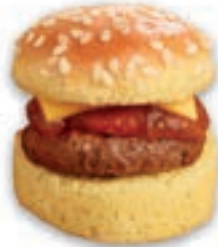
Mini Cheese Burgers V01 007 40

Mini beef burher in a bun with cheddar cheese and onion relish.