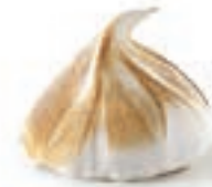
Orange & Cognac Baked Alaska 908 97

Vanilla ice cream, sultanas macerated in GRAND MARNIER® syrup and Italian meringue.