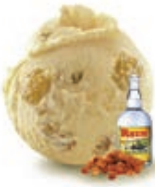
Rum & Raisin Ice Cream 921 01