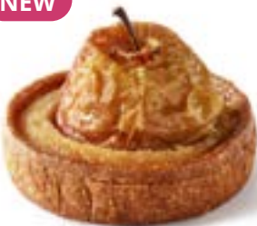
Baked Whole Apple Tart 955 42

Sable pastry case with almond creams, whole over-roasted apple. Heat in oven or grill.